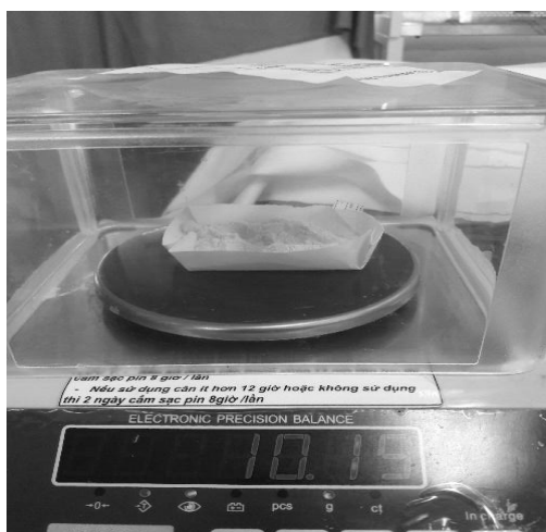
Photo 1. Weigh the garlic